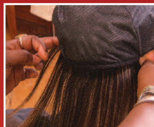
STEP 2 Apply the weave tracks