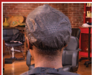
STEP 1 Place the cap on the head