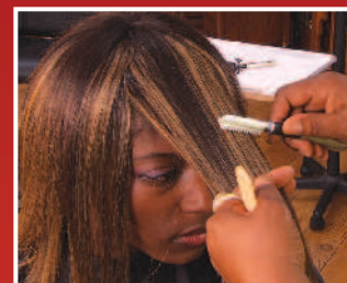
STEP 3 Cut & style

MADE WITH COOL-FLEX™. LETS AIR IN. KEEPS GLUE OUT.